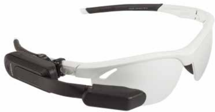
Garmin Varia Vision R6 899 | www.garmin.co.za

Do you fancy fighter jet technology in your cycling life? Obviously. Well with Garmin's Varia Vision in-sight display platform that's just a clip onto your sunglasses away. The Varia Vision sunglass attachment weighs 29.7g, boasts a 428 x 240 pixels display that provides data reading from your Garmin Edge 1 000 or Edge 520 headset, as well as vehicle-approaching warnings from your Varia Rearview Radar. The idea is to create a safer riding environment by allowing you to keep your eyes on the road at all times. The Varia Vision system has an 8-hour battery life, a water resistance rating of IPX7 and features an integrated ambient light sensor to ensure the screen is readable in all light conditions.