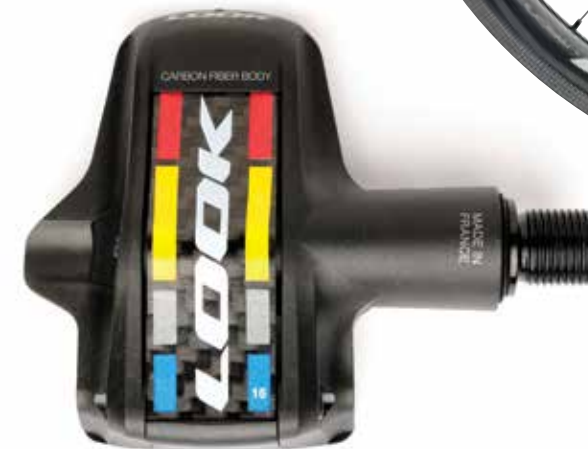
LOOK Keo Blade 2 Pedals R3 500 (cromo axle) and R6 000 (ti axle) | www.lookcycle.com

The Quattro in Fulcrum's Racing wheelset refers to a 40mm rim profile. Fulcrum say this is the sweet spot between aero gain and light weight, making for a superb do-it-all wheel. The 24mm outer width makes the 2016 variations stiffer than last year's models, but also provides a more aerodynamic tyre and wheel profile for riders running 25mm tyres. The wheels feature double butted aluminium spokes and a 3K carbon fibre on the braking surface to ensure longevity and consistent braking performance.