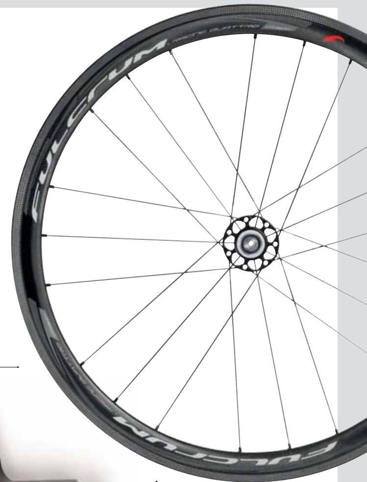
Fulcrum Racing Quattro Carbon Clincher Wheelset R24 999 | www.jjccycling.co.za

PowerTap power meter and is both forwards and backwards compatible as it'll accommodate any QR or thru-axle.