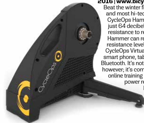
CycleOps Hammer Indoor Trainer Price tbc on SA launch in September 2016 | www.bicyclepower.co.za

Beat the winter freeze with one of the quietest and most hi-tech indoor trainers around, the CycleOps Hammer. Its 9kg flywheel runs at just 64 decibels and uses electromagnetic resistance to replicate a real road feel. The Hammer can replicate a massive array of resistance levels and can connect to the CycleOps VirtualTraining platform on your smart phone, tablet or laptop via Ant+ or Bluetooth. It's not limited to VirtualTraining however; it's compatible with the majority of online training platforms. Plus it provides power readings via an integrated