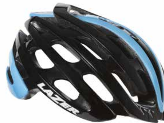
Lazer Z1 Helmet R3 975 | www.jjccycling.co.za

Back in 1984 LOOK invented the clipless pedal. Cast forward 32 years and it's still at the top of the pedal pile. Its Keo Blade 2 features a lightweight carbon body on a choice of chromo (110g per pedal) or titanium (90g per pedal) axles. The body is also reportedly the most aerodynamic on the market. At the heart of the LOOK Keo Blade 2 remains the blade retention system. Making use of a carbon blade rather than a spring, the Blade 2 does away with the resistance setting adjuster. To get the cleat release just right LOOK offers the blade in three different firmness options: the standard 12, the firm 16 and the hard 20 (the numbers refer to the Newton metres of force required to un-cleat).